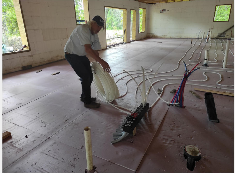
Pex Piping being rolled out on the pink foam on a new build.

The elbow kit is designed to hold and control PEX piping for your in-floor hydronic heat system. Each kit will handle 1 loop of PEX piping.